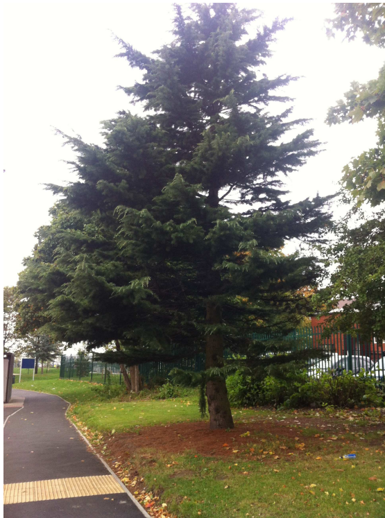
Hollinwood Christmas Tree Hollins Road Adjacent to Oasis Academy

In previous years the Hollinwood Christmas Tree was situated at the former Roxy site but it was agreed with the potential development of this site, a new site would have to be identified. In spring 2013, a living tree on Hollins Road adjacent to Oasis Academy was agreed as the new site for the tree.